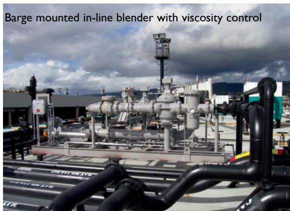
Barge mounted in-line blender with viscosity control

Leveraging in-line blending technology to become a dominant bunker supplier