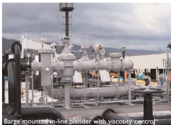
Barge mounted in-line blender with viscosity control

Over the last five years advanced control in-line blending technology has proven to flexibly deliver products, on specification at the lowest cost. This can be achieved with a significant reduction in operating costs and a simultaneously auditable guarantee of quality. Advanced blender control systems in conjunction with developments in mixing, analysis (viscosity, density and sulphur) and improved expertise in the integration of measurement and control equipment have enabled a quantum leap in the application of in-line technology for bunker blending.