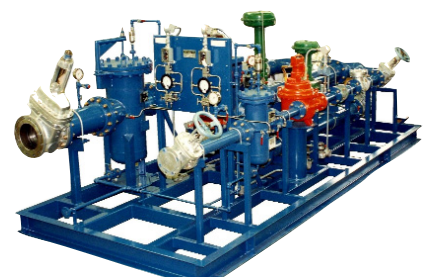
Blender for barge installation