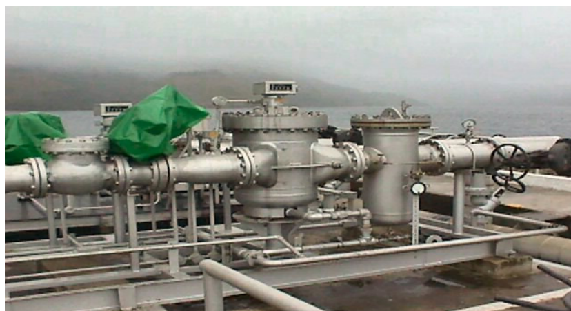
Fuel oil bunker blender

Jiskoot in-line blenders have a high turndown. This allows you to use the blender for a wide range of parcel sizes and customers, maximising the flexibility of your operation.