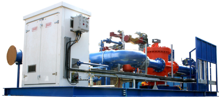
Viscosity trim in-line blender

Jiskoot blenders use a controller with unique control algorithms that respond instantly to changes in process conditions or feedstock quality. The heavy fuel oil and cutter stock are continuously measured and adjusted during the batch to ensure optimum quality and minimum 'give-away'. Jiskoot systems are designed to ensure consistent quality throughout the batch even during tank changes, feedstock starvation, loss of power or the unlikely failure of a system component.